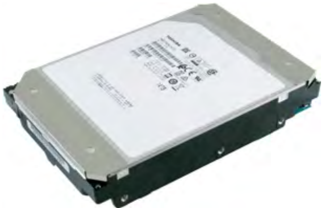
9-platter helium-filled 14-TB HDD MG07ACA series

Toshiba Electronic Devices & Storage Corporation will continue to collaborate with Toshiba Group companies and external suppliers in order to develop products that meet customers' needs and contribute to the enhancement of the infrastructure that underpins today's information society.